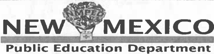
EXHIBIT A (27114 - FINAL FY23-24)

Award Name: Early Literacy and Humanities Laws: 2023 HB/SB: 398 Section: V Paragraph: 104